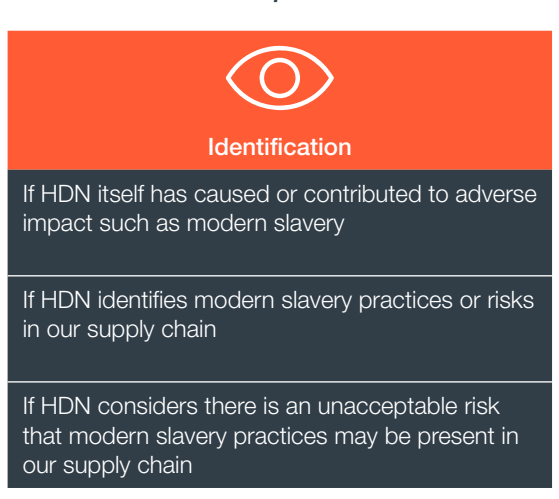
Table 1: Remediation process overview

The Group's core governance policies on our website under the 'Corporate Governance' tab: https://www.hmccapital.com.au/our-funds/homeco-daily-needs-reit/